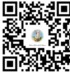
Shrine of Fatima & St. Cajetan Needs of Church Fundraiser https://paypal.co/IGML_nW6Uc

Please make checks out to: Shrine of Fatima